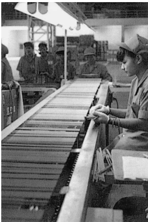
Fig. 3 - To ensure the quality of RB-26 an employee inspects the electrodes piece by piece in accordance with Kobe Steel's standard. (Above: Thai-Kobe Welding)

Further, the emphasis on quality pervades the factories in Japan and overseas – with nearly all of our employees involved in quality control circles. To ensure RB-26 is defect-free, we inspect it piece by piece and lot by lot of production by using Kobe Steel's proprietary inspection processes and procedures.