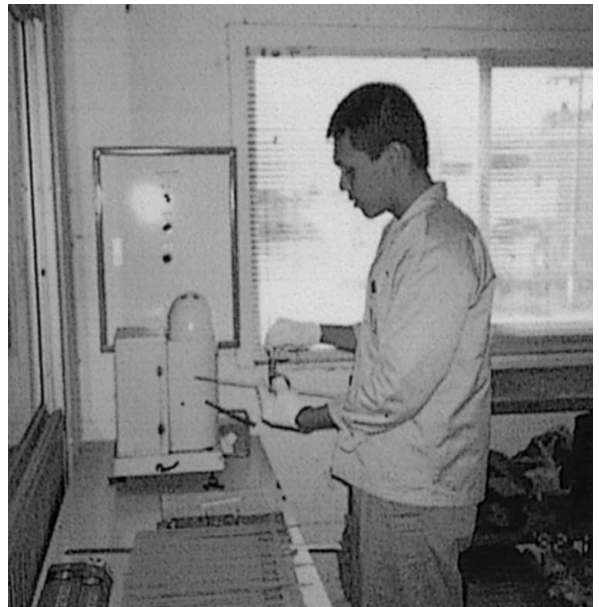
Fig. 4 - In order to make sure the quality of RB-26 an employee inspects the electrodes lot by lot by using Kobe Steel's proprietary inspection procedures. (Above: Thai-Kobe Welding)

To further ensure customer satisfaction, our marketing staffs work closely with customers, providing technical services that include training in welding techniques. Unsurpassed quality of RB-26 and customer satisfaction remain our highest priorities.